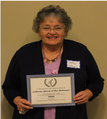
Lutheran Church Of Our Redeemer University South NA